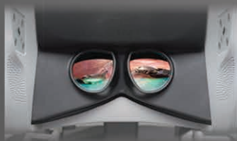
MAGNIFIED 3D HD VISION