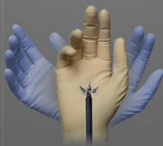
ENDOWRIST® INSTRUMENTATION WITH INTUITIVE® MOTION